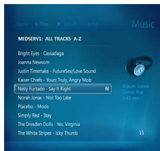
Browsing media content using a rich user interface