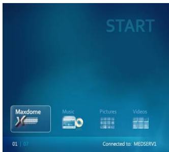
Entry point to various digital contents: the EVO1 Main Menu

Drawing on full standard-compliant HTML support, Windows Media and secure DRM, the EVO1 platform enables our OEM customers to offer premium content business models. In addition to their own media content, consumers can seamlessly access these offers at the click of a button – at any time. This is ensured by the integration of the market-leading Windows Media DRM rights management system for premium content. All EVO1 Platform-based products, which use the Windows CE operating system and NXP Nexperia series processors exclusively, are outstanding playback stations for high-quality video and TV content therefore.